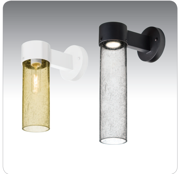
JUNI 10 SHOWN IN GOLD BUBBLE (JUNI10GD) & JUNI 16 SHOWN IN CLEAR BUBBLE (JUNI16CL) WITH LED OPTION